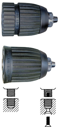
Tool group A01 Type 102-60 Extra