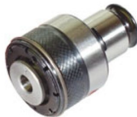
Größe 1 M3 - M12