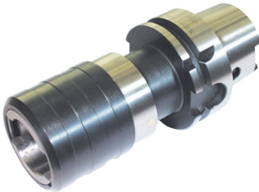
Größe 1 M3 - M12

The tapping collet has to be ordered separately !